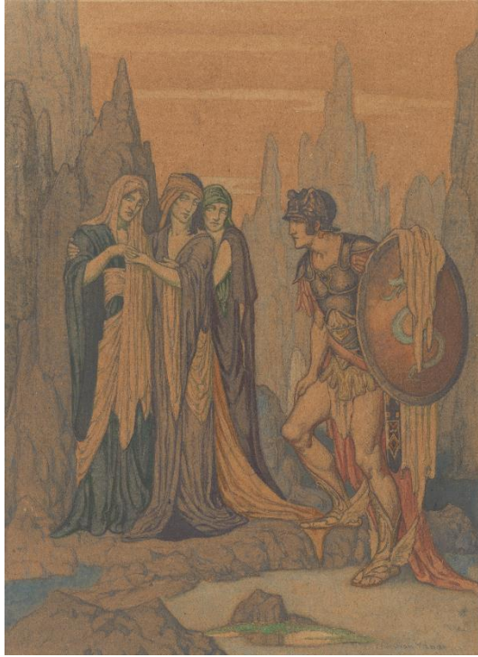
Fig. 4 (above). Christian Waller, Perseus and the Graeae (c. 1922). Painting in brush and watercolour over underdrawing in black pencil, 42.9 x 31.3 cm. National Gallery of Australia, Canberra. Purchased 1979.

general, and Burne-Jones in particular. 19 One example is the artistic couple, Napier Waller (1893-1972) and Christian Yandell (1894-1954), who explored medieval and mythological themes across a variety of media including watercolour—as in Yandell’s Perseus and the Graeae (c. 1922) (Fig. 4) with its a creative adaptation of a scene from Burne-Jones’s Perseus series—and linocuts such as Waller’s The Questing Knight (1923) or Yandell’s Morgan le Fay (c. 1927) that clearly reflect the early twentieth-century revival of interest in Pre-Raphaelite graphic work. 20