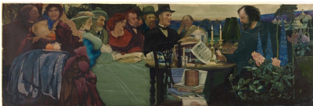
Fig. 1 William Blamire Young, Untitled [Tennyson and his Friends] , (c. 1905). Watercolour, gouache and black ink, 59.2 x 108.8 cm. National Gallery of Australia (NGA).

This special issue of the AJVS devoted to the theme of Pre-Raphaelitism in Australasia is the second of a two-part endeavour that has taken several years to complete. The first part ( AJVS Vol. 22.2, 2018) focussed to a large extent on the early history of the Pre-Raphaelite Brotherhood, as seen through the lens of its individual members and associates whose works were held in art museums and public libraries in Australia and New Zealand. The significant familial, personal and professional ties that existed between these British artists and the distant colonies, and the extent to which they encouraged a lasting Antipodean interest in the movement, was one thread to emerge from this first volume. Another was the importance of decorative art and design—produced by such firms as Morris & Co., and Lyon, Cottier & Co.—in disseminating a Pre-Raphaelite and Arts & Crafts aesthetic throughout Australasia, not only in the form of wallpapers, textiles, and other household furnishings, but also through the medium of stained glass.