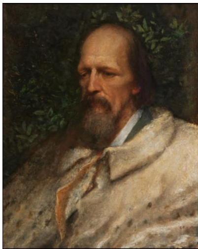
Fig. 7. G. F. Watts, Tennyson , 1890. Oil on canvas, 64.4 x 52 cm. Gift of the Artist, 1901. AGSA.

While some of Watts's symbolist paintings met with incomprehension and even condemnation in New Zealand, it is striking to find several of his major works—two figurative compositions and three portraits (one a copy)—being actively acquired by Australian public collections between 1899 and 1907. One reason behind this enthusiasm was the artist's longstanding friendship to Alfred Tennyson, the recently deceased Poet Laureate, an association that took on heightened local significance in light of the presence in Australia of the poet's son, Hallam, Lord Tennyson, as Governor of South Australia and later Governor-General of Australia from 1899-1902 and 1903-04 respectively. 30 In fact, in his first public address as Governor, Hallam Tennyson referred to a portrait by Watts, observing the facts