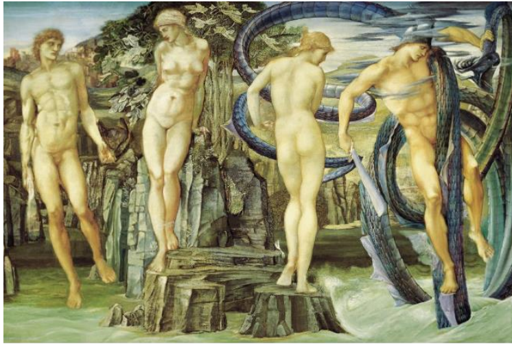
Fig. 2 (left). Edward Burne-Jones, Perseus and Andromeda (1876). Oil on canvas, 152.2 x 229 cm. Elder Bequest Fund 1902, AGSA.

Of course, artists in Australia and New Zealand did not need to travel to Europe to see physical examples of the Pre-Raphaelite movement. A steady stream of these works of art began to enter the countries' art collections, by purchase or donation, from the late 1880s onwards, with no less than five major oil paintings and several works on paper by Burne-Jones being acquired by the public art galleries of Adelaide, Auckland, Melbourne and Wanganui in the following four decades, including Perseus and Andromeda (1876) in 1902 (Fig. 2), The Wheel of Fortune (1871-85) in 1909, The Garden of Pan (1886-87) in 1918, The Car of Love, or Love's Wayfaring (c. 1870-98) in 1924 and the enormous Fortitude (c. 1898) in 1926. 16 Copies of famous works were likewise highly valued, with Charles Fairfax Murray's replica of Rossetti's Proserpine (date unknown) being accepted into the collection of the NGV in 1905, 17 while a copy of Burne-Jones's King Cophetua and the Beggar Maid (1906) was proudly presented to the Bendigo Art Gallery by Melbourne collector William Drummond in 1913 (Fig. 3). 18