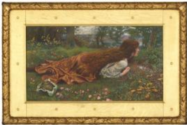
Fig. 6. Edward Robert Hughes, The Princess out of School , 1901. Gouache and watercolour, 52 x 95.3 cm (sheet). National Gallery of Victoria. See link for information on framing.

Alongside the towering figures of Burne-Jones and Rossetti, younger exponents of the second wave of British Pre-Raphaelitism—especially those who delighted in its more fanciful and imaginative possibilities—were appreciated in Australasia as a distinctive component of contemporary art, and their works were often acquired directly from artists or current exhibitions in Britain. This was the case with Snowdrop and the Seven Little Men (1897) by John Dickson Batten (1860-1932), an example of the modern Tempera Revival that was purchased in the same year it was executed by the Art Gallery of New South Wales (AGNSW). Similarly, Souvenir of a past age (1895) by F. Cayley Robinson (1862-1927) (Fig. 5) was bought from the artist by the Art Gallery of South Australia (AGSA), while Edward Robert Hughes's The Princess out of School (c. 1901) (Fig. 1 in Gaston article) was selected by the NGV from a London exhibition on the advice of the Royal Academy. 22