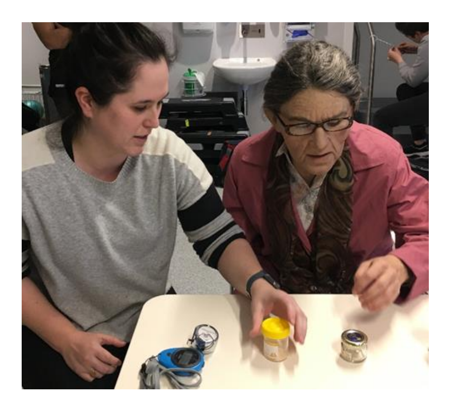
Figure 1. MASK-ED<sup>™</sup> (KRS Simulation) character with students during tutorial.