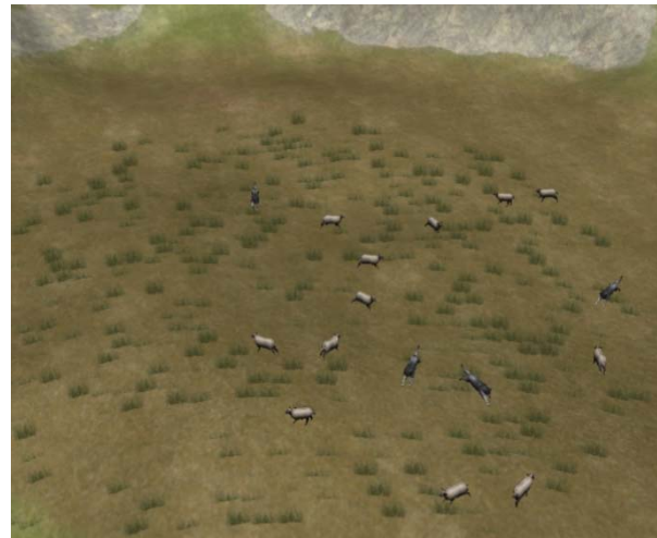
Figure 2: Predator Model created in Unity3D

We are currently developing a new virtual world with Australian-themed scenarios using the game development tool Unity3D 2 . The topics being considered include: Year 8) ecosystems; Year 9) diseases; and Year 10) evolution. These topics have been identified and suggested by the science teachers in our focus groups. While these scenarios are currently more focused in the biological sciences, we intend to develop modules for physics and chemistry content. To this end, as part of this Discovery project and specifically as the focus of a concurrently running Linkage Project with the Centre of Learning Innovation in the New South Wales Department of Education we are currently developing a number of simulation models that will be incorporated into the Australian MUVE. All three school years have common skills concerned with scientific inquiry: hypothesis, investigations, experimental design, the use of secondary resources and data, using equipment, managing risk, collecting data including ICT, analysis, conclusions and communications. The initial in-world activity is being developed for Year 8 science with additional activities being developed in years two and three of the project. The new virtual world is based on the national science curriculum that will be implemented into Australian schools in 2011.