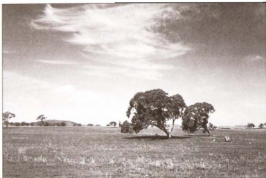
Gungahlin on a Plate: Wind