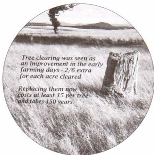
'All those lovely trees'

The striped legless lizard A very ordinary worm-like thing We've got it just before it's gone down the gurgler Surrounded by cats and dogs and houses—we've got a very difficult job. (1996:26)