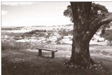
Gungahlin on a Plate: Eric's seat

extremely nerve wracking. I'd love to develop a program of walks now, on the basis of what I learned from them.