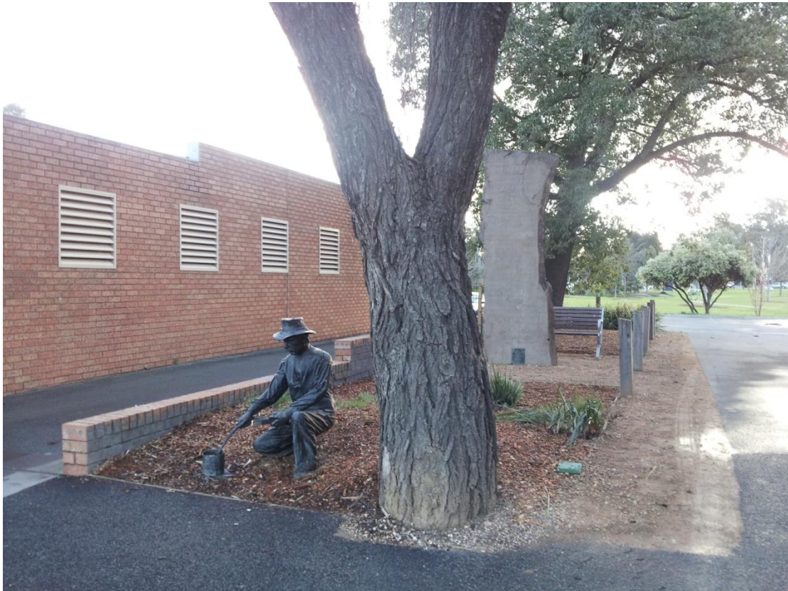
The site of Furphy's house in Welsford Street, Shepparton

Franklin emphasises the picturesque environment surrounding the writer's house, with the 'untouched bush', the river as a site of children's play, and the steep 'chasm' immediately behind the sanctum. The description allows the reader to imagine Furphy's writing room in a 'natural' setting; a far cry from its current, concrete-bound location.