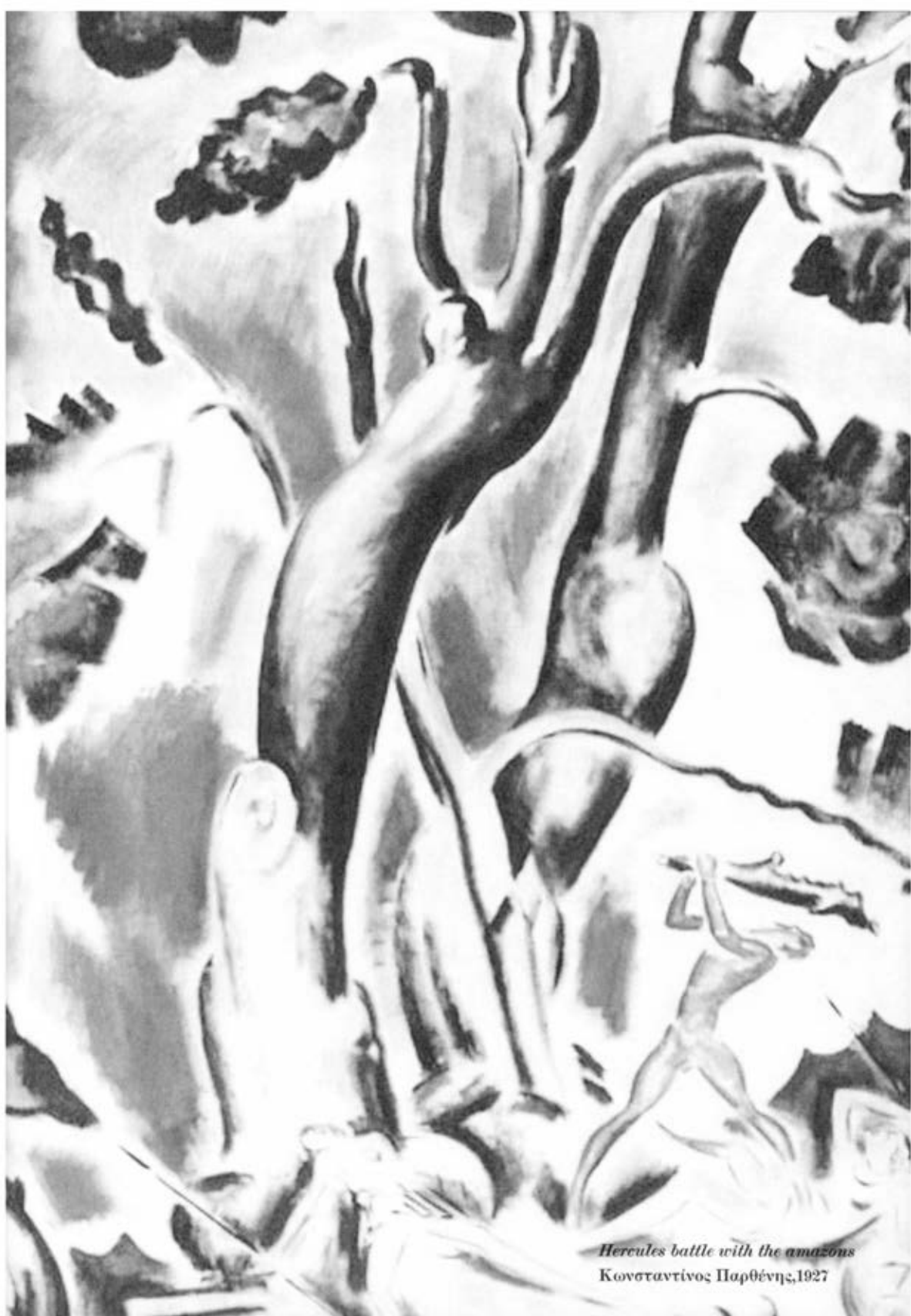
Hercules battle with the amazons Κωνσταντίνος Παρθένης, 1927