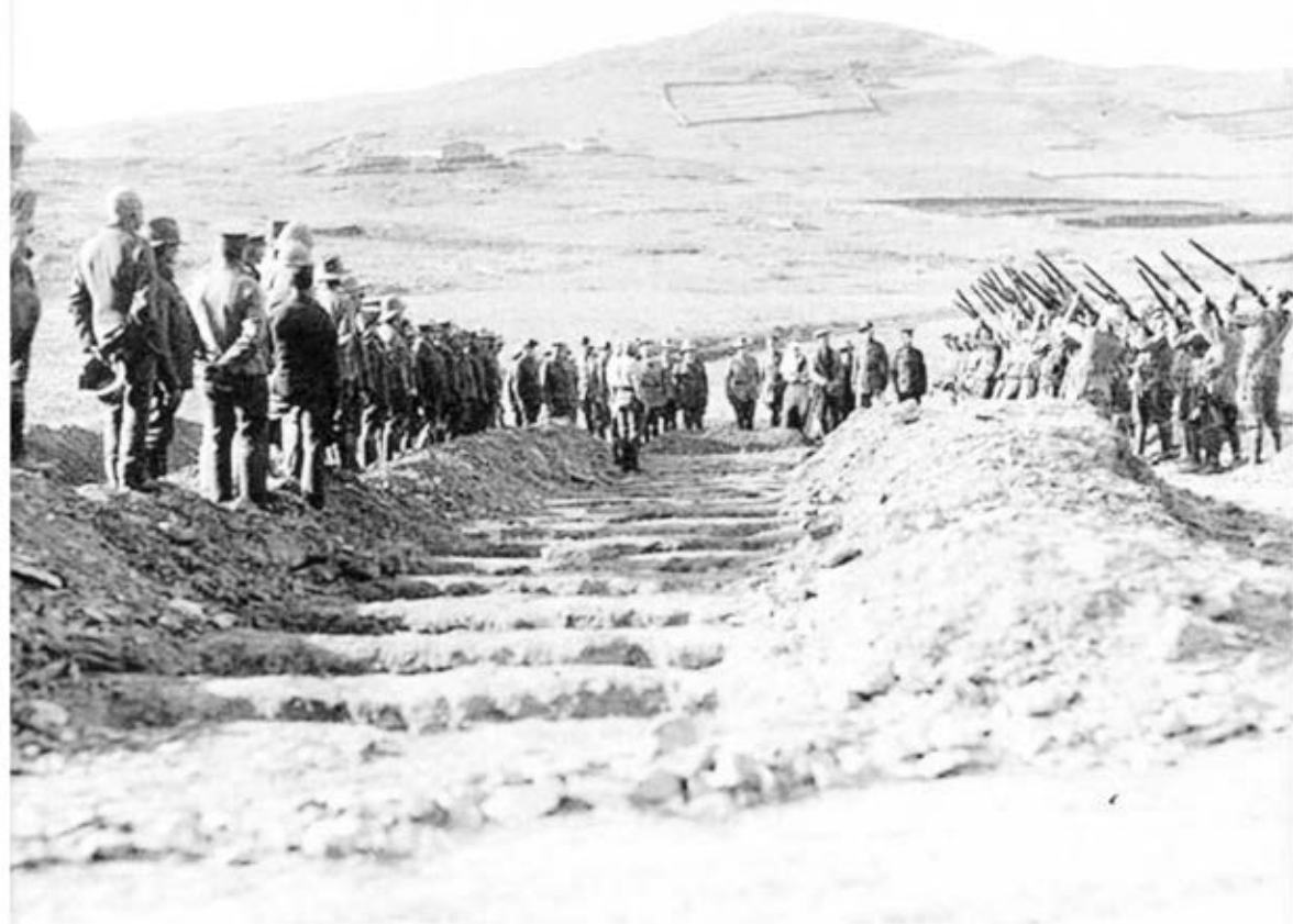
Figure 10: The gun firing salute following one of the first burials at Portianos, Lemnos.

Of the 1,235 Allied soldiers buried at either the Mudros or Portianos cemetery, there can be found 148 Australians and 76 New Zealanders. The main military cemetery on Lemnos is at east Mudros, about one kilometre from the town and next to the civilian graveyard. The cemetery was begun in April 1915 and contains 885 Commonwealth graves, including 98 Australians, plus 32 burials of other nationalities, mainly Russians. 11