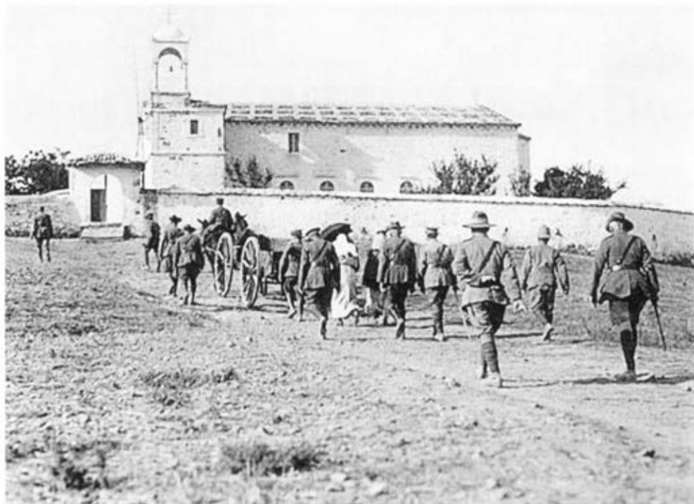
Figure 7: An Australian soldier's funeral, with officers and nurses from the 3rd AGH in escort.

Lemnos was arguably the essential obverse of Gallipoli. While Gallipoli was the site of conflict, its landscape almost immediately sacralised, the essential role of Lemnos was effectively a secular counter-world of care, respite, entertainment, renewal and normality. As well as being physically removed from the fighting, troops were able to interact with civilians, females (nurses and Lemnians), sleep, eat, be clean and generally participate in the discourses and practices associated with peace rather than war. In relation to his experience of Lemnos with elements of the 4th Infantry Brigade,