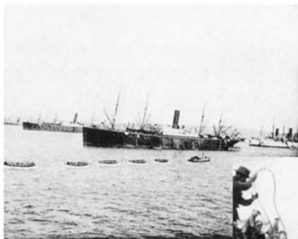
Figure 5: Australian troops practising in Mudros Harbour for Gallipoli landing, April 1915.

the early days of the campaign, the Allies attempted to break through Turkish lines, while the Turks tried to drive the Allied troops off the peninsula. Efforts on both sides ended in failure and the ensuing stalemate continued for the remainder of 1915. The most successful operation of the campaign was the evacuation of troops on 19 and 20 December. This brief and typical re-telling of the campaign neglects the important role played by Lemnos and its people.