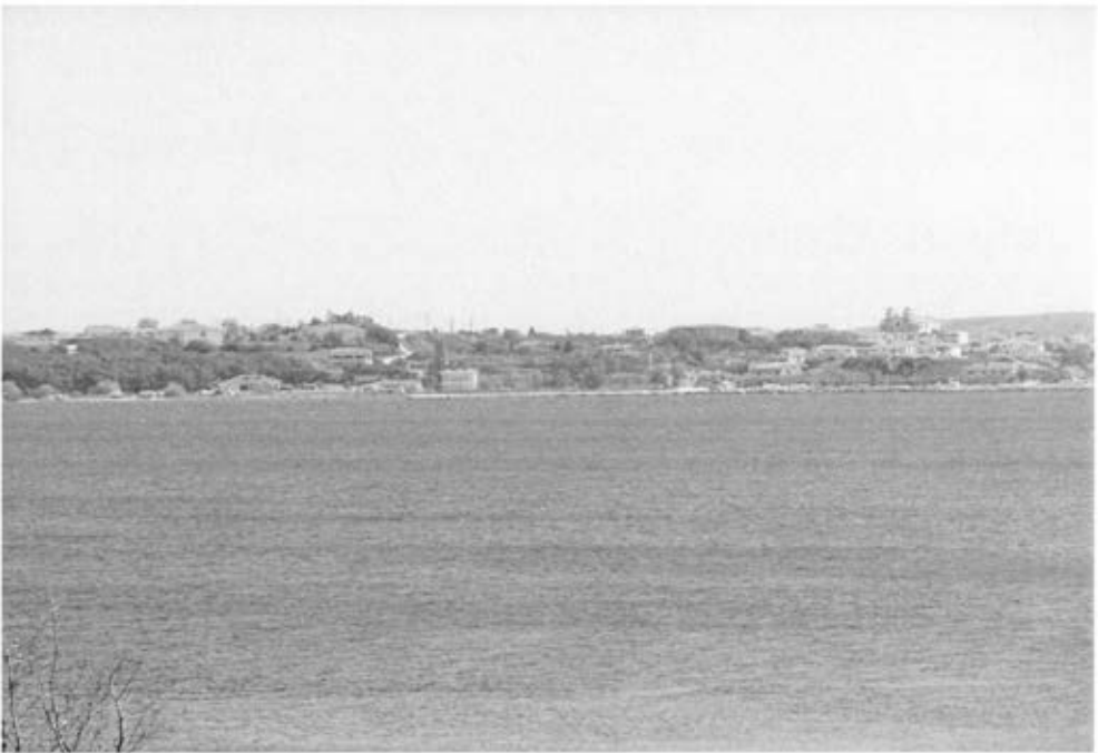
Figure 1: Mudros harbour today looking east to the town site, May 2011.