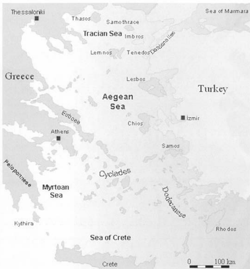
Map 1: Lemnos in relation to the Dardanelles and Gallipoli peninsula