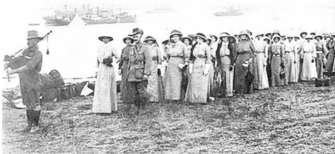
Figure 6: Arrival of the first detachment of Australian nurses being led by a piper.