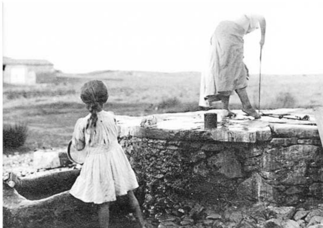
Figure 3: Scene from a Greek village on Lemnos, 1915.

Literature about the 1915 campaign continues to be published. 4 While some authors, including Graham Seal and Jim Claven, make mention of Australian personnel interacting with Lemnians, most work does not give much consideration, if any, to the inhabitants of the island from where the campaign was launched. Les Carlyon's popular 2001 publication, Gallipoli , for instance, includes only two references to Lemnos/Mudros in its 569 pages. Garrie Hutchinson's An Australian Odyssey from Giza to Gallipoli (1997) makes no reference to Lemnos, nor does his Gallipoli: The Pilgrimage Guide (2007). Bruce Scates' Return to Gallipoli (2006) also neglects to mention Lemnos or Mudros. More recently, Peter Stanley's Simpson's Donkey (2011) opens on Lemnos. 5 The Gallipoli campaign has, over time, narrowed to exclude any location other than the peninsula, even though sites, such as Lemnos, were integral to the expedition.