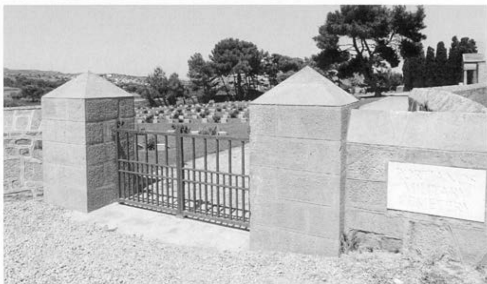
Figures 9a and b Allied war cemeteries at East Mudros and Portianos on Lemnos, 2011.