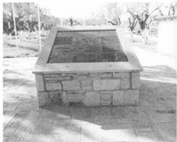
Figures 8a and b: Anzac War Memorial at quayside, Mudros Harbour, May 2011.

The Lemnos Municipal Council and the Lemnian Association of Victoria hoped that the memorial would become part of the pilgrimage for Australians who want to pay homage to the deeds of these who risked their lives at Gallipoli. This hasn't happened to date, but locals remain hopeful. The Mayor of Mudros in 2011 expressed the view that he found it strange that so many people visited Gallipoli, the site of much suffering and death, and did not visit the place, the counter-world, where the Anzacs were hosted