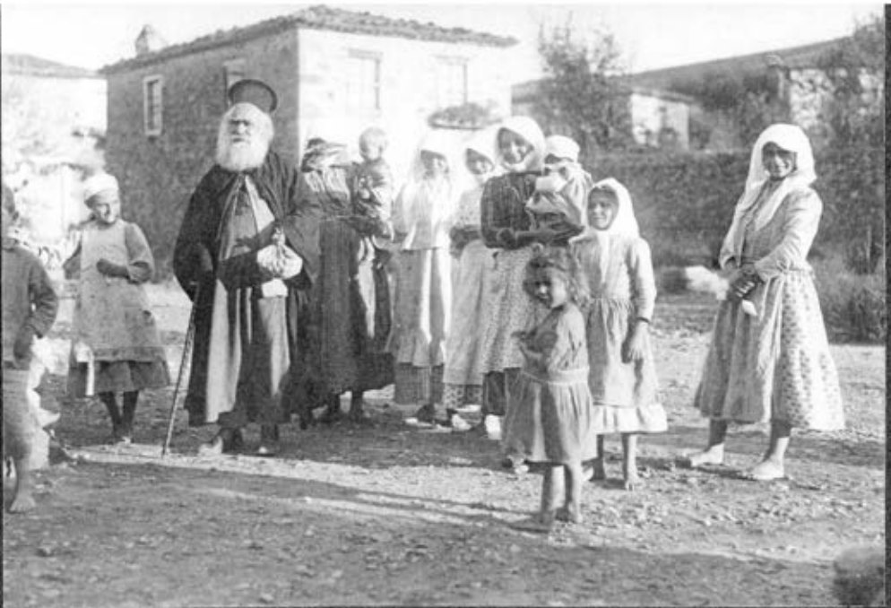
A Greek Padre & his flock

Figure 4: Greek priest and some of his congregation, Lemnos 1915.