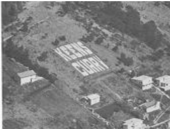
Fig. 6. Early photo of Keens Curry sign

Watson took over the curry-powder business. He was quite the entrepreneur. One of his marketing strategies was to purchase land in the foothills of Mount Wellington overlooking Hobart and transform it into a huge advertising sign. He collected rocks, arranged and painted them white to form the words 'Keens Curry' in 15 meter high letters (Davies 212). It certainly generated controversy, with threats of injunctions by those who felt it defaced their city. The question was even hotly debated in Parliament. Watson defended his right to advertise on his own property – and won (Edwards 36-38). The sign is still there – periodically rearranged to comment on the politics of the day ('Fred's Folly', 'No Dams', 'Gunns Lie'). In another unusual marketing strategy, Horace once organised for some curry to be placed on a ship bound for Antarctica so he could claim that Keens Curry was the first curry in the Antarctic!