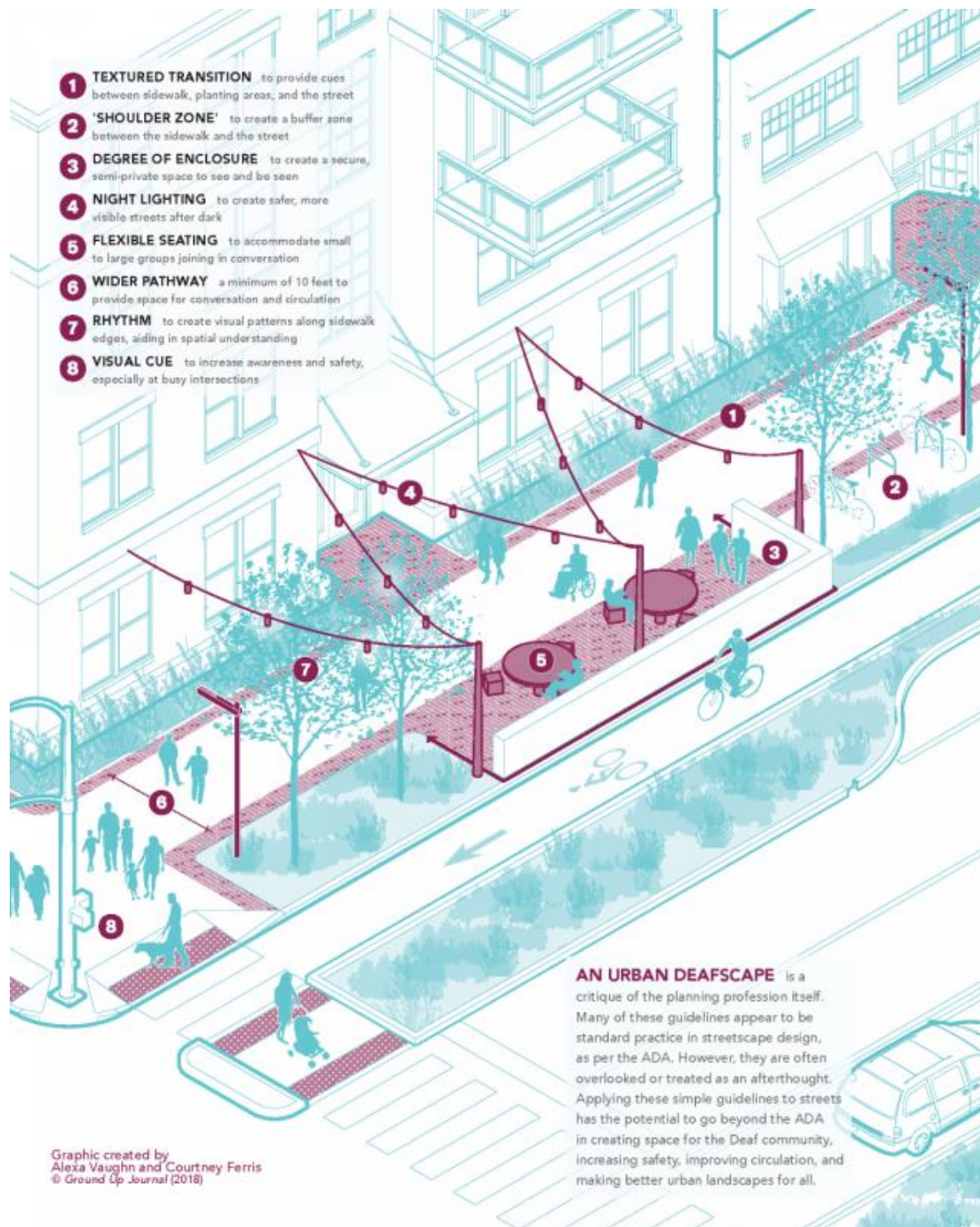
Fig 2. Graphic of what a 'Deaf City' might be