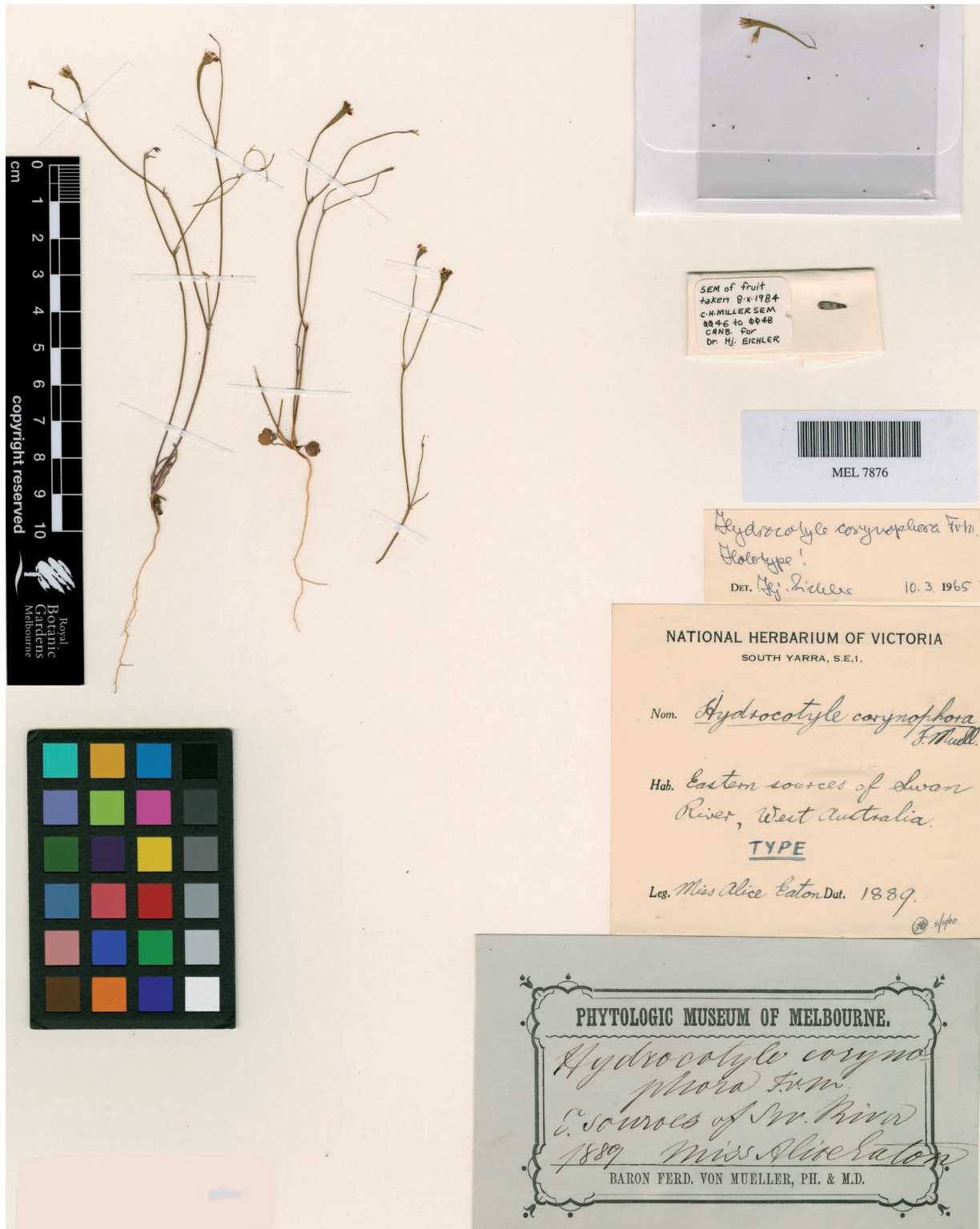
Fig. 1. Holotype of Hydrocotyle corynophora F. Muell. (MEL7876) reproduced with permission from the National Herbarium of Victoria (MEL), at the Royal Botanic Gardens Victoria.