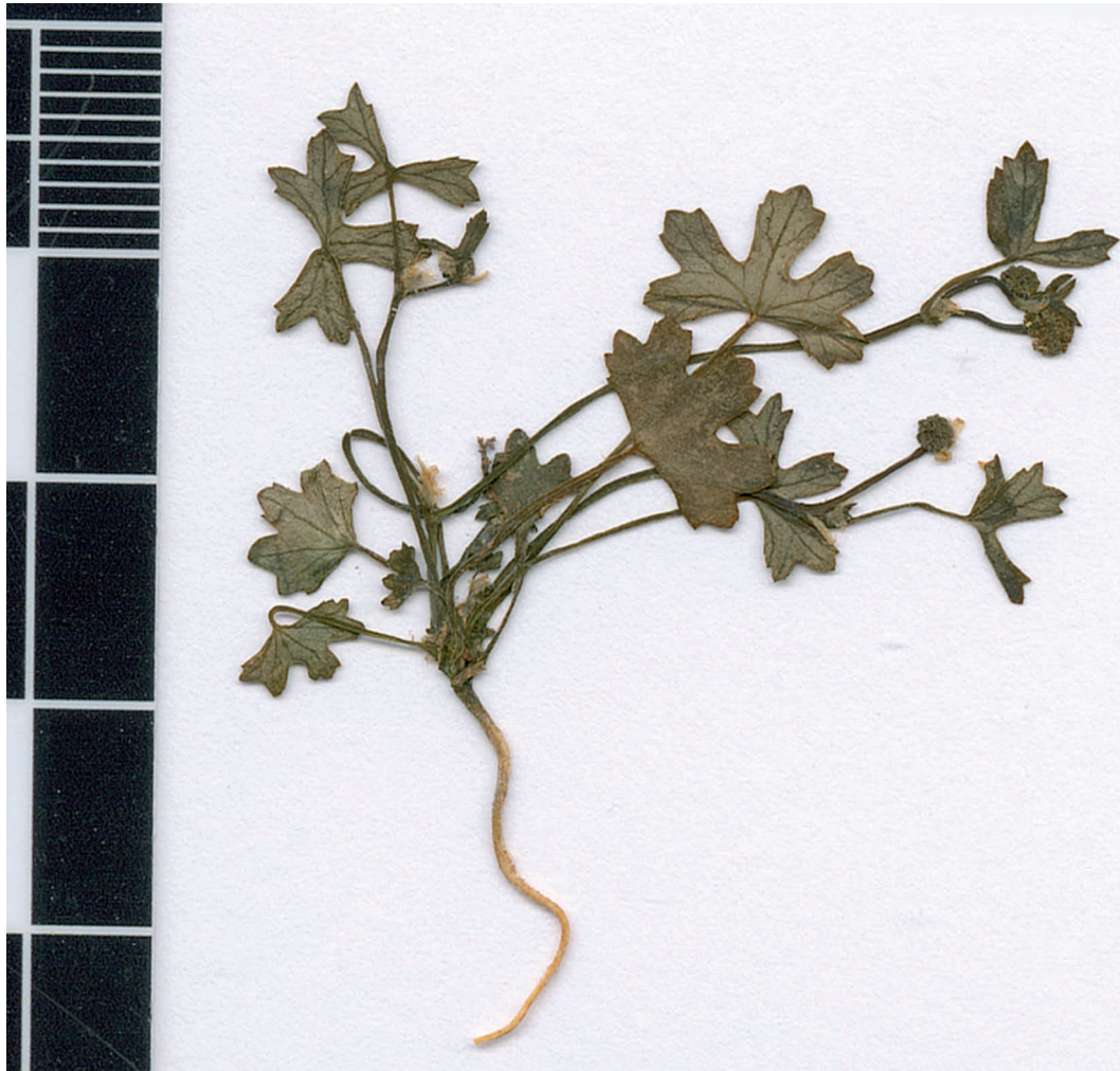
Fig. 3. Hydrocotyle corynophora (K.R. Newbey 6035, PERTH 03401502). A single plant from the voucher exhibiting a good representation of leaf morphology for the species. Scale on the left indicating both centimetre and millimetre increments.

Additional specimens examined: WESTERN AUSTRALIA: COOLGARDIE: Southern Cross: All nine voucher specimens collected south-east of Southern Cross, within the vicinity of Marvel Loch, [precise localities withheld for conservation reasons], K.R. Newbey 6035, 21 Sep 1979 (PERTH 03401502); J. Warden & D. Leach 37945, 29 Sep 2015 (PERTH 08684529); J. Warden & D. Leach 37954, 21 Oct 2015 (PERTH 08684537); J. Warden & D. Leach 37955, 21 Oct 2015 (PERTH 08684545); J. Warden & D. Leach 37951, 22 Oct 2015 (PERTH 08684502); J. Warden & D. Leach 37952, 22 Oct 2015 (PERTH 08684553); J. Warden & D. Leach 37953, 22 Oct 2015 (PERTH 08684561); J. Warden & D. Leach 37949, 23 Oct 2015 (PERTH 08684499); J. Warden & D. Leach 37950, 23 Oct 2015 (PERTH 08684510).