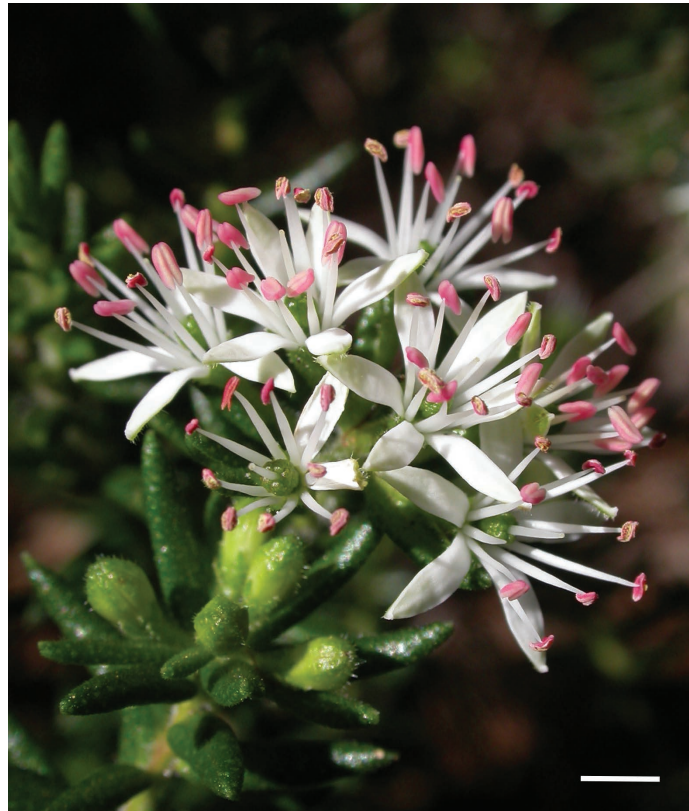
Fig. 2. Inflorescence of Leionema westonii ; from L.M.Copeland 3741 et al. (type gathering). Image by J.J. Bruhl. Scale bar = 2 mm.

Distribution: Leionema westonii occurs in the New England Bioregion (Department of the Environment 2013) where the species is known only from Oxley Wild Rivers National Park (Fig. 3). This area includes much of the Macleay Gorges system on the eastern fall from the New England Tableland, New South Wales. The single known population of L. westonii occurs towards the southern end of the park near Steep Drop Falls approximately 40 km ENE of Walcha.