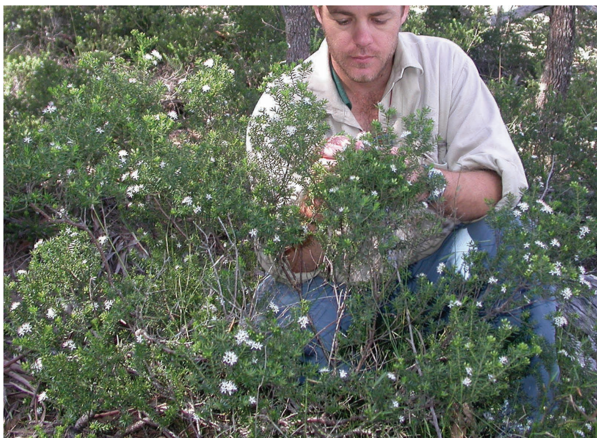
Fig. 1. Habit of Leonema westonii , L.M. Copeland 3741 et al. (type gathering).

Shrub , rhizomatous and much-branched, to 70 cm tall. Stems pilose with spreading white simple hairs. Leaves: petiole 1–1.4 mm long, sparsely pilose; lamina narrowly elliptic or linear, 6–16 mm long, 1–1.8 mm wide, obtuse, revolute, adaxially pilose, abaxially minutely white-papillose and sparsely pilose. Inflorescence a terminal cyme composed of 4–10 solitary flowers in the upper axils. Pedicels 3–5.5 mm long, pilose, bearing a subulate, pilose bracteole 2.4–2.8 mm long just below the calyx. Calyx cup-shaped, 1.3–1.6 mm long, sparsely hispidulous, sometimes with minute stellate hairs, 5-toothed, the teeth triangular, c. 1 mm long. Petals 5, spreading, narrowly elliptic, 4–4.6 mm long, 1–1.2 mm wide, acute, glabrous adaxially, glandular punctate and sparsely and shortly pilose abaxially, white. Stamens 10, exerted, spreading; filaments terete, 4–4.6 mm long, glabrous, white; anthers elliptic, 1–1.5 mm long, pink. Disc annular surrounding a gynophore c. 0.5 mm long, dark green. Ovary of 5 carpels, fused for most of their length, c. 1 mm long, 0.7 mm diam., papillose, green; style terete, 2.5–2.8 mm long, white; stigma capitate, white. Fruit and seeds not seen. Figs. 1, 2.