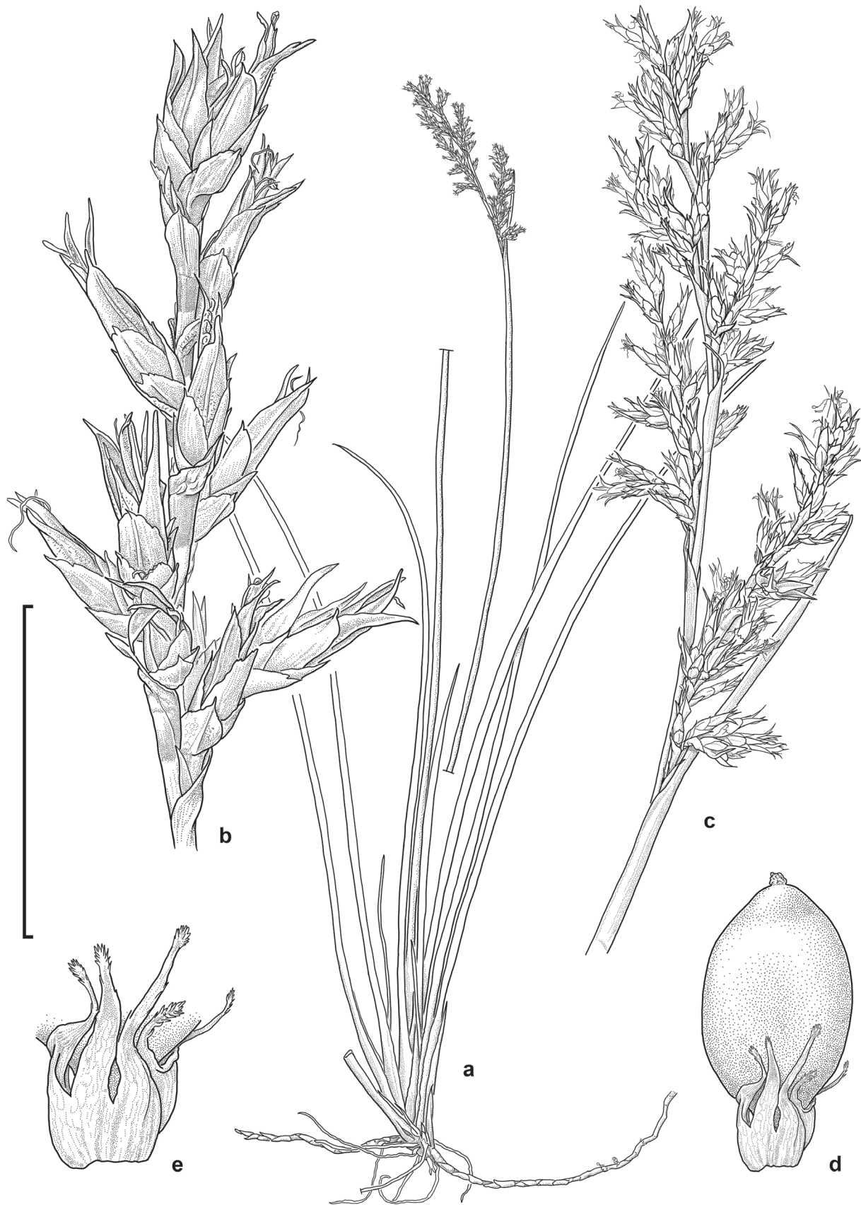
Fig. 1. Lepidosperma prospectum , from Gibbon Trail, Royal National Park. A. Plant habit including spreading rhizomes. B. Inflorescence branchlet and spikelets. C. Inflorescence. D. Nutlet with perianth attached. E. Perianth scales with scabrous hairs at apex. Voucher: R.L. Barrett RLB 9330 (NSW). Illustration by Lesley Elkan. Scale = : a = 20 cm, b = 1.5 cm, c = 5 cm, d = 0.5 cm, e = 0.3 cm.