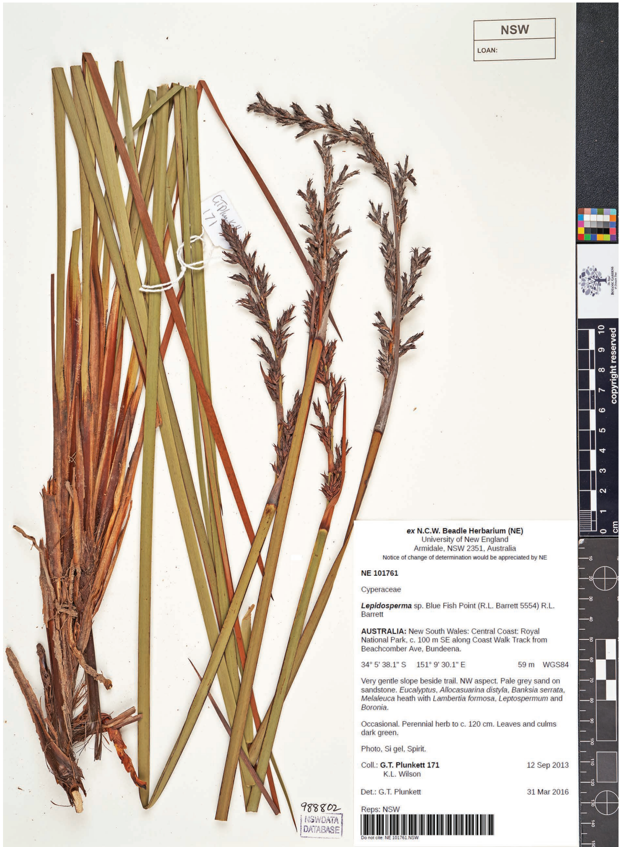
Fig. 2. Lepidosperma prospectum , herbarium specimen from Bundeena Coastal Walk, Royal National Park. Voucher: G.T. Plunkett 171 & K.L. Wilson (NSW).