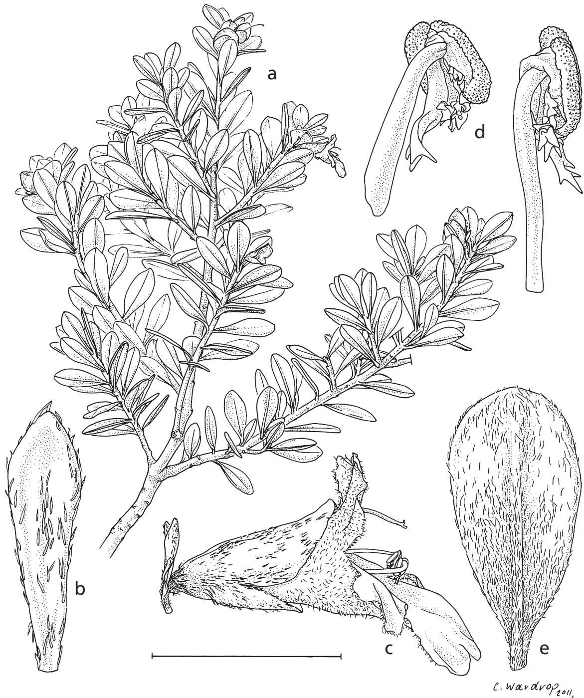
Figure 4. Prostanthera tozerana . a , habit, showing flowering branchlet with flowers and developing fruits; b , detail of prophyll; c , lateral view of flower showing prophylls, calyx, corolla, partial view of stamens, style and stigma; d , stamens showing oblique dorsal view of anther locules, anther appendages and staminal filaments (adaxial stamen – left; abaxial stamen – right); e , leaf, abaxial surface showing antrorse hairs ( B.G. Briggs 7351 ). Scale bar: a = 5 cm; b = 0.3 cm; c , e = 1 cm; d = 0.2 cm.