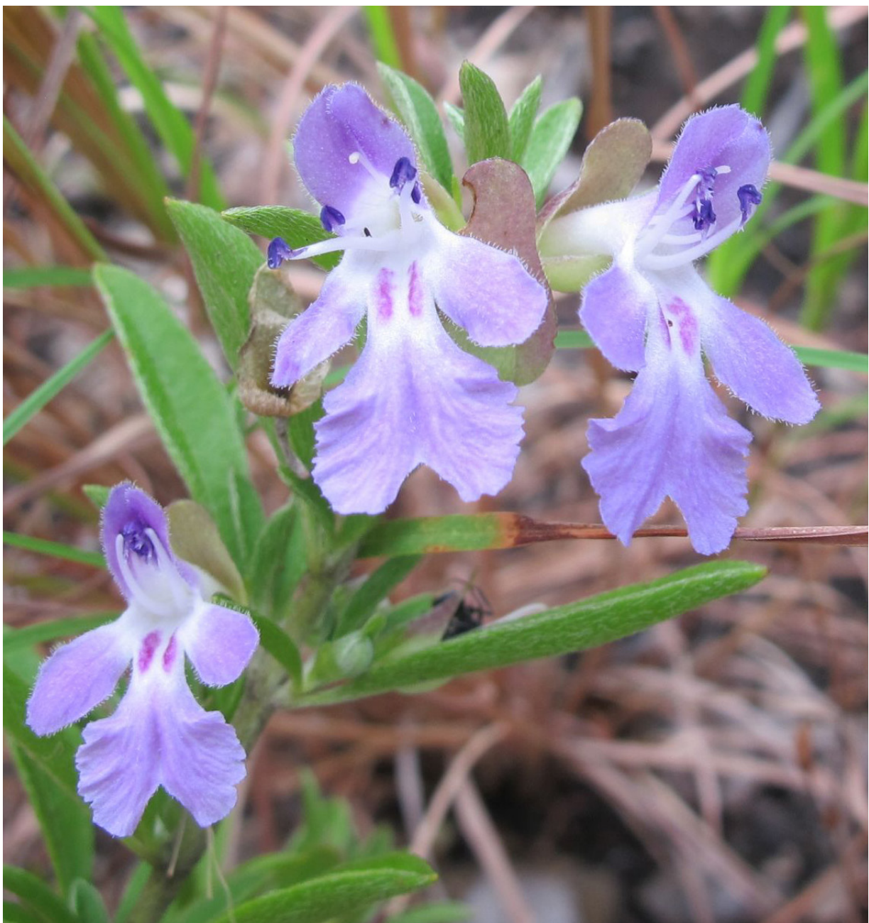
Figure 2. Prostanthera clotteniana . Flowering branchlet of plant growing in the Ravenshoe State Forest (A. Ford 5982 & Collins).

base gradually long-tapering; margin entire; apex obtuse to shortly acuminate; venation indistinct, midrib indistinct. Inflorescence a frondose racemiform confluence, uniflorescence monadic; 2–4(–6)-flowered [per confluence]. Podium 2–4 mm long, densely hairy and glandular. Prophylls persistent, inserted near base of calyx [a, axis to anthopodium ratio 2–6], opposite, narrowly obovate, 3–5.5 mm long, 0.3–0.5 mm wide [length to width ratio 8.3–10(–13.8), length of maximum width from base to total lamina length ratio 3–4(–5.5)], moderately to sparsely hairy (hairs as for leaf lamina), moderately to densely glandular; base attenuate; margin entire; apex apiculate; venation not visible. Calyx dull green, sometimes with maroon on adaxial lobe; outer surface sparsely to moderately hairy, becoming dense towards base, with hairs white, antrorse, moderately to densely glandular; inner surface of tube glabrous at base, hairy near and at mouth, lobes sparsely to moderately hairy; tube (2.9–)3–4.2 mm long; abaxial lobe broadly ovate, (2.1–)2.5–3 mm long, (2.1–)2.4–3.5(–3.7) mm wide at base [length to width ratio c. 0.9–1.1], apex rounded or obtuse; adaxial lobe ovate, appearing rhombic when distal margin concave, (3–)4.4–5.7(–7.2) mm long, (2.2–)4–5.4 mm wide at base [length to width ratio (0.8–)1–1.5(–2.2)], apex rounded [adaxial lobe length to abaxial lobe length ratio (1–)1.5–2.9].