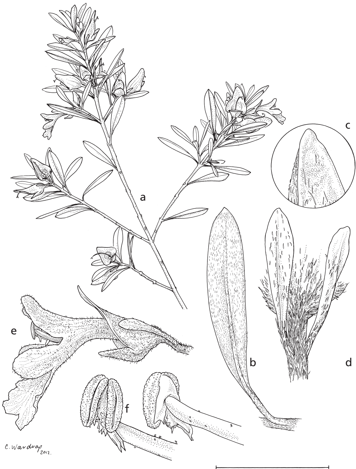
Figure 3. Prostanthera mulliganensis . a , habit, showing flowering branchlet with flowers and developing fruits; b , leaf, abaxial surface showing antrorse hairs; c , detail of apex of leaf, mostly showing adaxial surface; d , prophylls and base of calyx; e , lateral view of flower showing prophylls, calyx, corolla and partial view of stamens; f , stamens showing ventral (left) and dorsal view of anther locules, connective appendages, and staminal filaments ( J.R. Clarkson 5838 ). Scale bar: a = 5 cm; b , e = 1.2 cm; c , d , f = 0.3 cm; g = 0.4 cm.